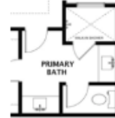
Two Sink Option