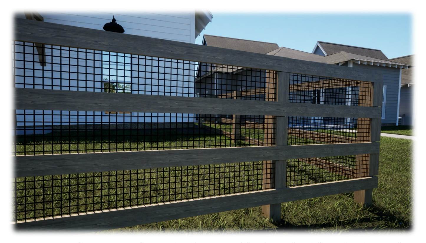
Fencing options for Estate Lots will be priced per lot. Fences will be a farm-style with four rails and wire mesh.