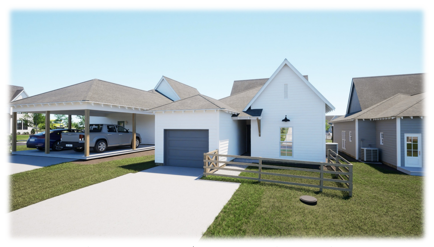
Fencing available for 1 Car Garage homesites at $2,500. Fences will be a farm-style with four rails and wire mesh.