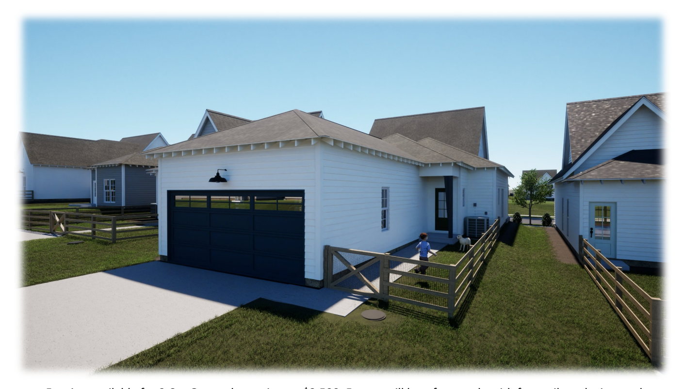
Fencing available for 2 Car Garage homesites at $2,500. Fences will be a farm-style with four rails and wire mesh.