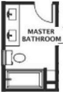
Two Sink Option