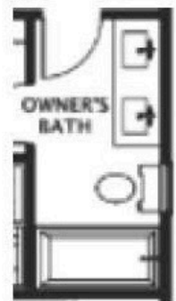
Two Sink Option