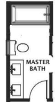
Two Sink Option