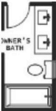
Two Sink Option